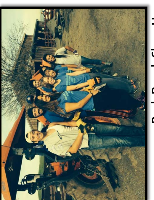
Rush Ranch Clean Up